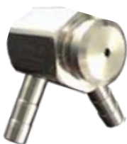
Remote Air Mist Nozzle