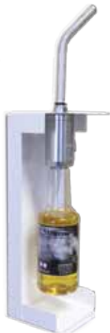
XStreme™ Vapor Station