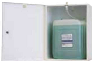
ASU-20 Spray Station