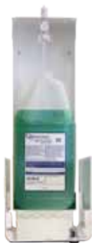
ASU-4 Spray Station